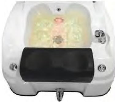
Extensible shower for rinsing