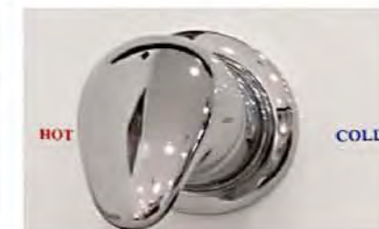
Cold and hot water